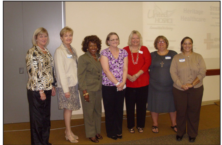
Participants of the Northeast Georgia Elder Rights Symposium, held September 8, pose for photograph.

provides visually impaired adults and children in the local school system a unique mentoring experience. The CARE-NET will also sponsor Middle Georgia-wide "CARE-FAIR" on November 3 that will feature representatives from local service providers, health screenings and a panel of experts on caregiving.