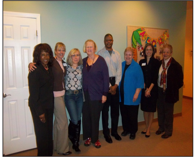
Members of Atlanta CARE-NET shown in above photograph.