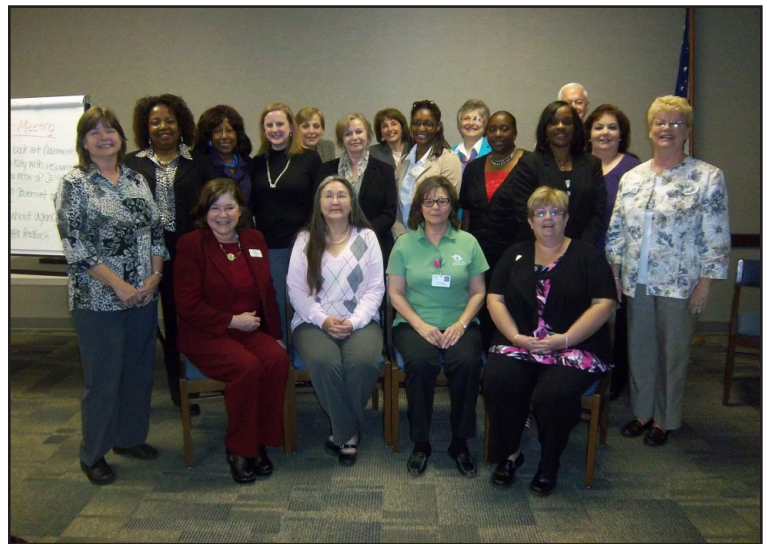
Members of the West Central Georgia CN pose for photograph.