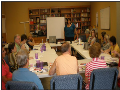
Participants shown left attend Dementia Training.

The Caregiver Support Group meets on the first and third Wednesdays of each month. Individual counseling is also available for caregivers