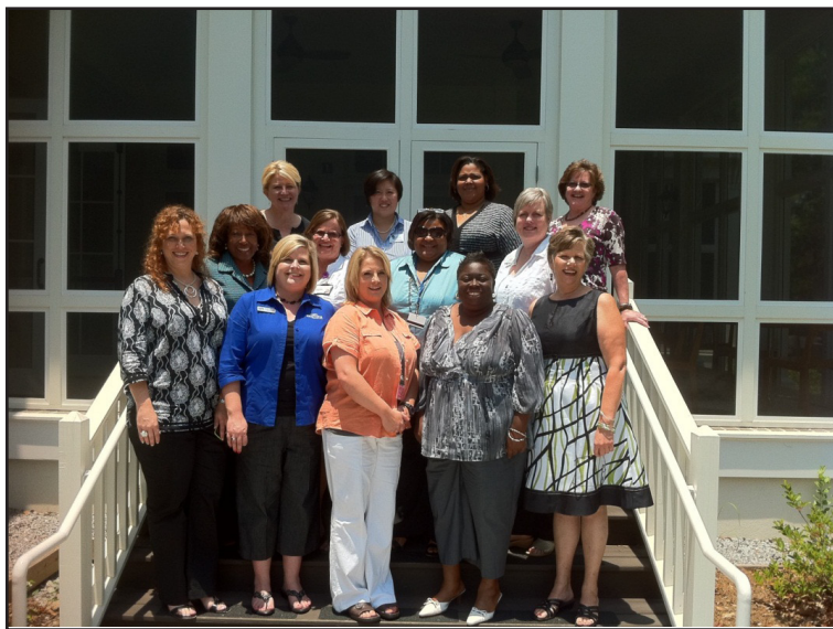
Members of the Coastal CARE-NET Coalition pose for a photograph during one of their regional meetings in Richmond Hill, Georgia.

Committed individuals from the field of health care, mental health, education, ministry, civic groups, law enforcement, community businesses, judicial system, and charitable organizations are encouraged to become a part of Coastal CARE-NET.