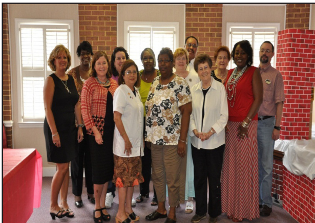
Members of the Southwest Georgia Coalition attend August 12 CN Meeting.