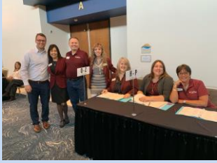
Visiting Angels was at the State of the City Address. Supporting Pueblo