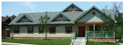
Visiting Angels at Pueblo Child Advocacy Center