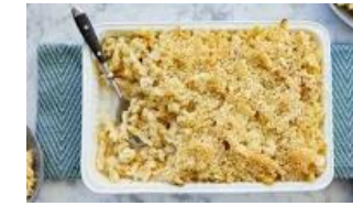
Cauliflower Mac and Cheese